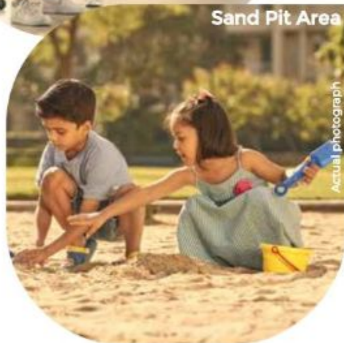
Sand Pit Area

Flex your muscles, and sweat a bit at the gym. If you're interested in taking some strokes, dive into the swimming pool.