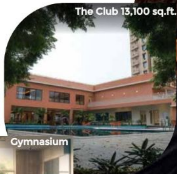
The Club 13,100 sq.ft.

The 13,100 sq.ft. clubhouse gives you more space to add the 'more' to your life. More fun, more comfort, more friends, more conversations, more enjoyment, and more experiences.