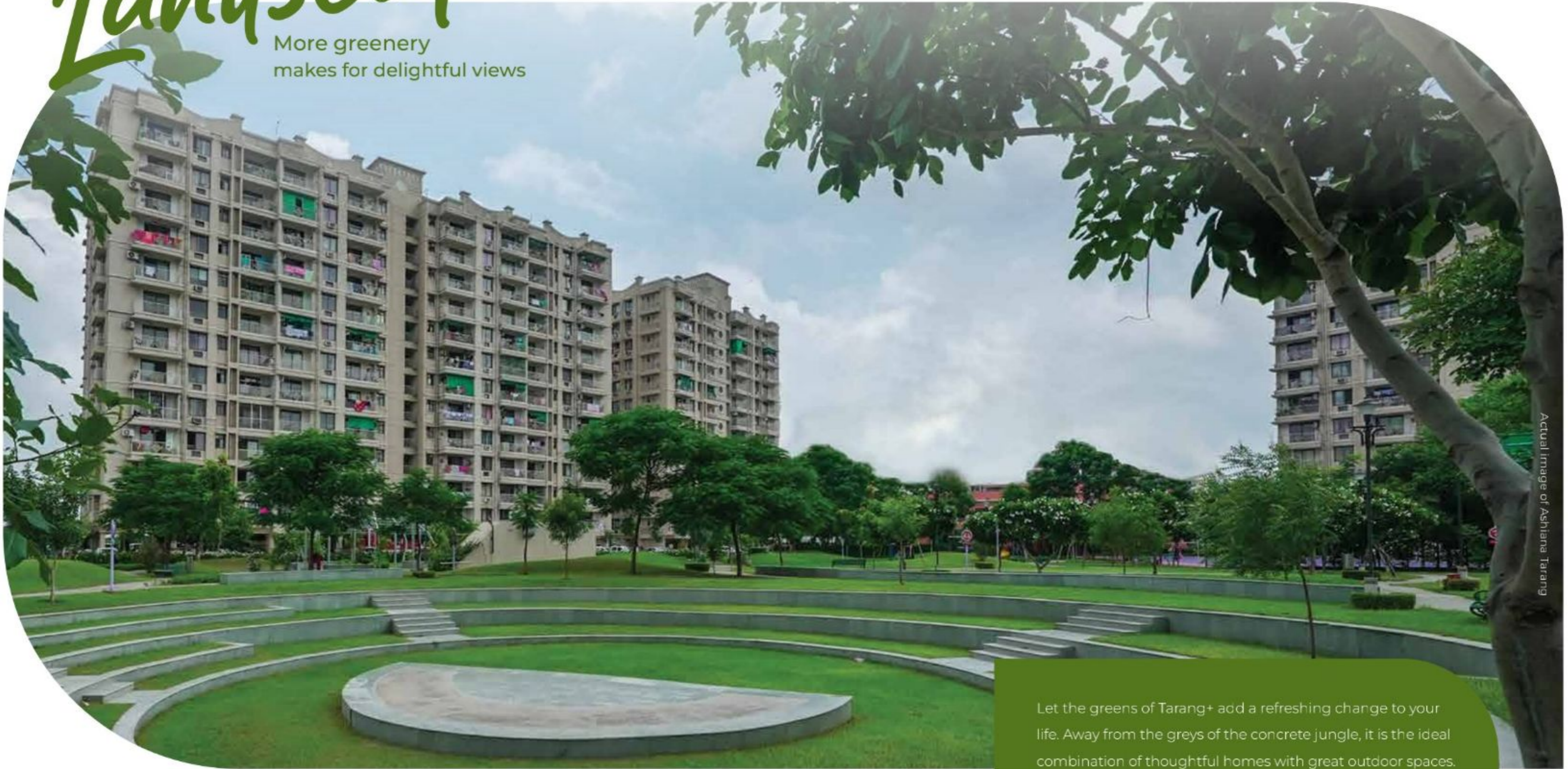
Actual Image of Ashiana Tarang

More greenery makes for delightful views