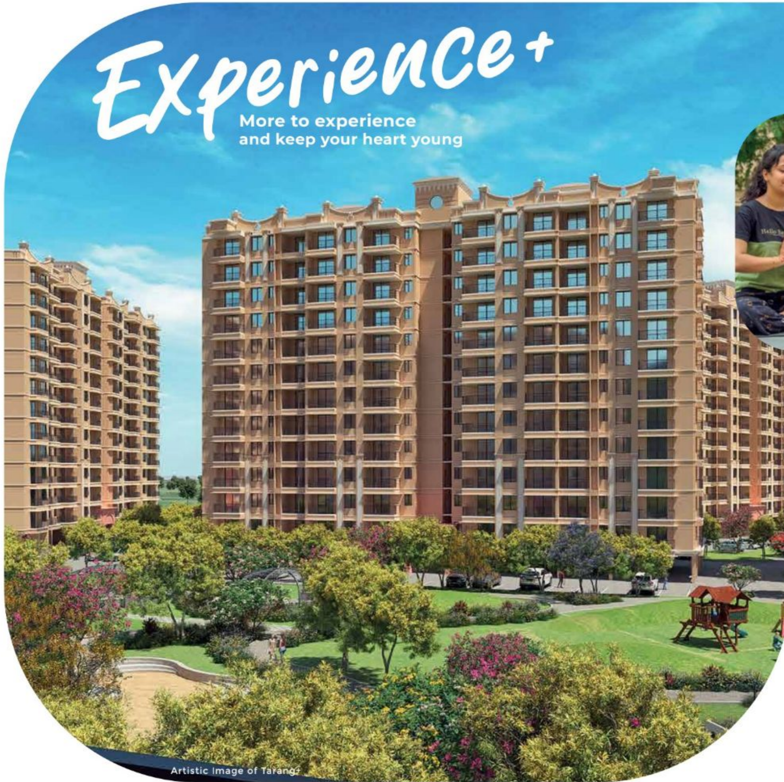
Artistic Image of Tarang

More to experience and keep your heart young