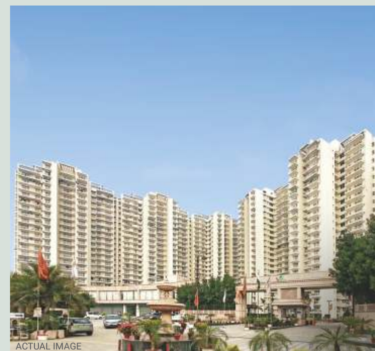
THE CORALWOOD, SECTOR-84, NEW GURUGRAM