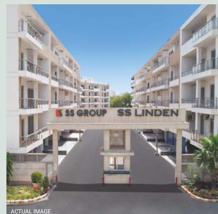
SS LINDEN, SECTOR 84 - 85, NEW GURUGRAM