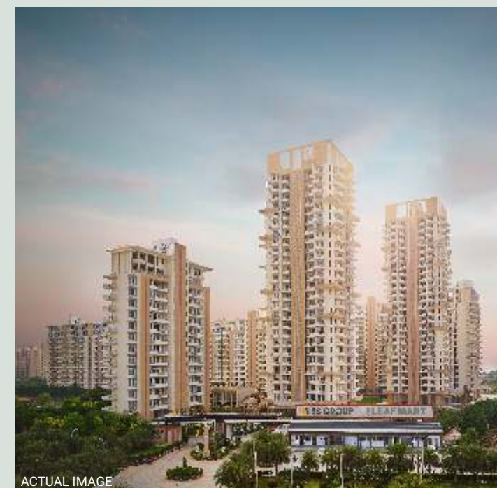
THE LEAF, SECTOR-85, NEW GURUGRAM