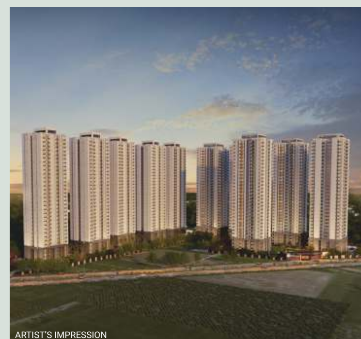
SS CENDANA, SECTOR - 83, NEW GURUGRAM