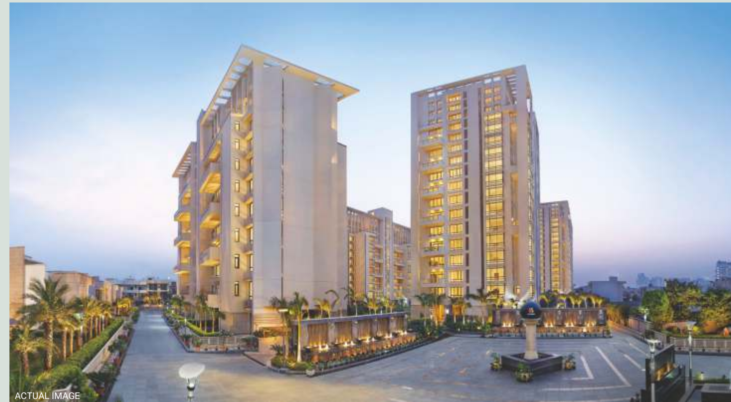
THE HIBISCUS, SECTOR-50, GURUGRAM