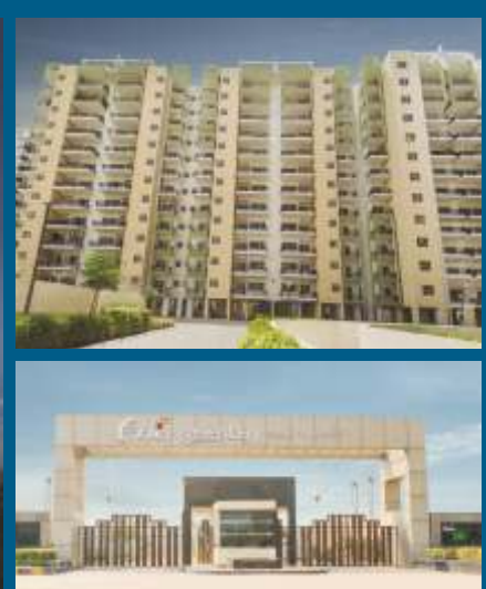
Actual Images of Carnation Residency, Floreal Towers, Aster Court and Orris Greenbay