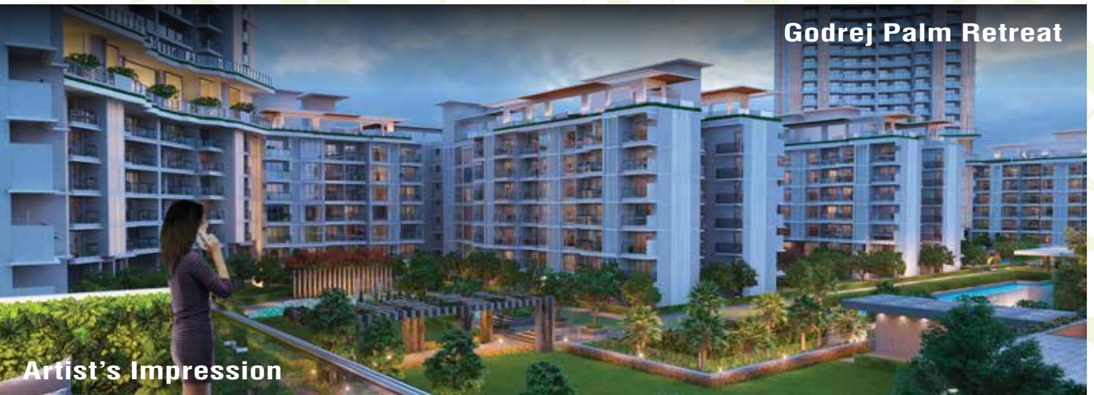
Godrej Palm Retreat