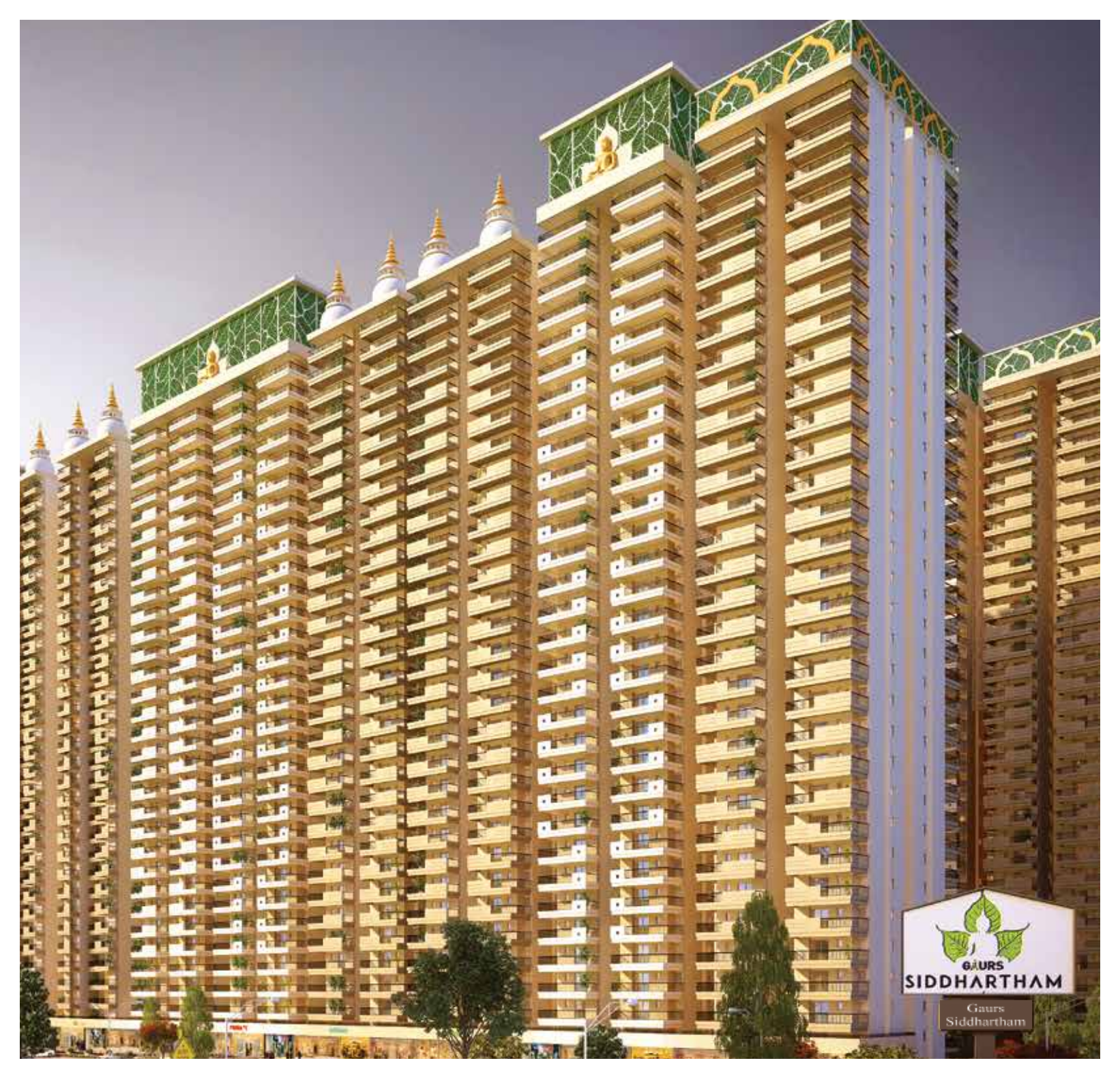
All images including stock images, colours, pictures and accessories are indicative and used for illustrative purposes only. For the actual project details, please refer to the specifications mentioned in the subsequent pages of this brochure.