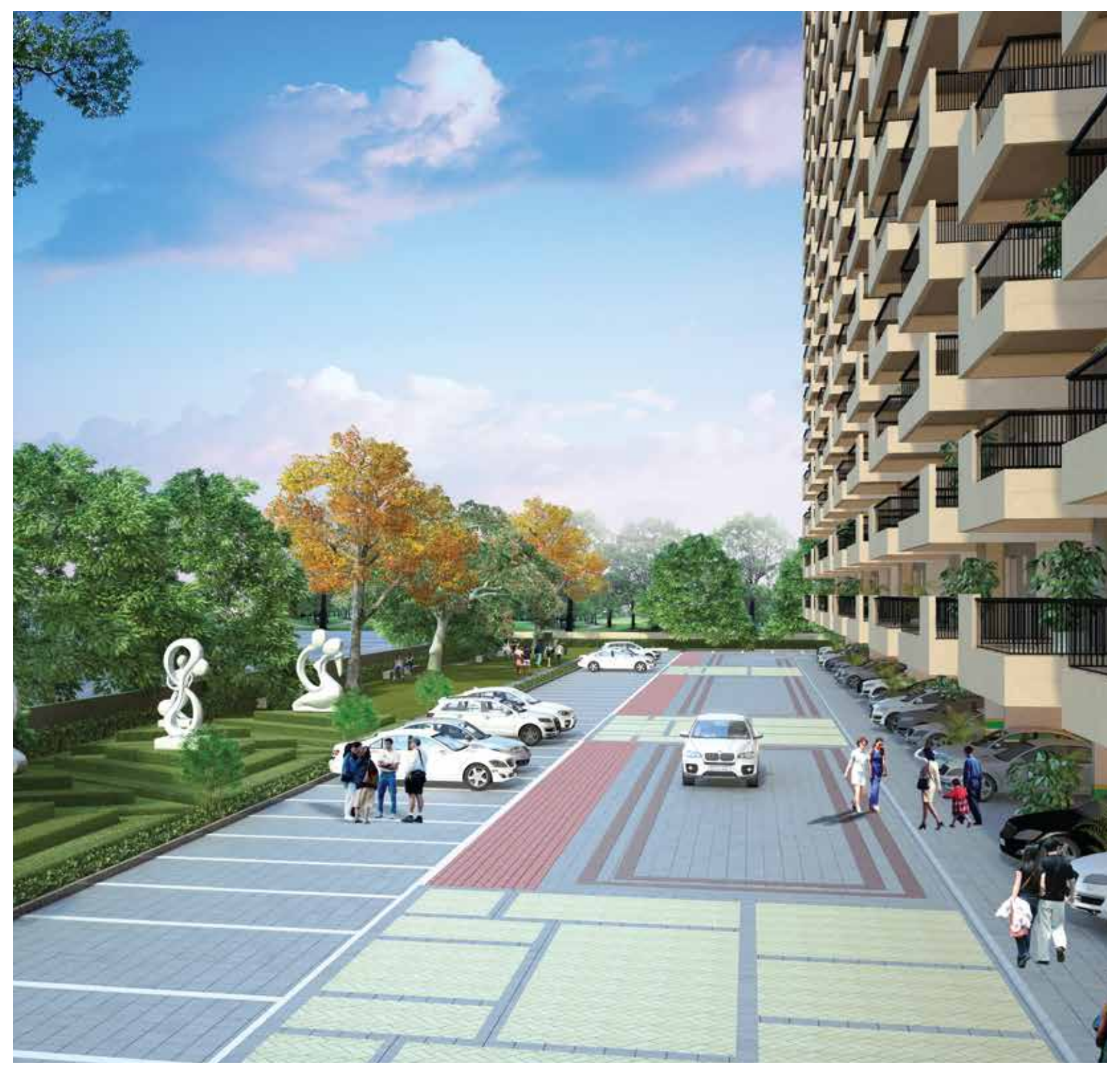
All images including stock images, colours, pictures and accessories are indicative and used for illustrative purposes only. For the actual project details, please refer to the specifications mentioned in the subsequent pages of this brochure.