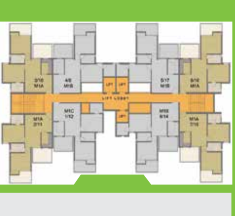
CLUSTER PLAN BLOCK- A & B