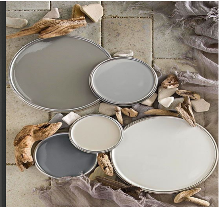
COLOUR PALETTE FOR KITCHEN