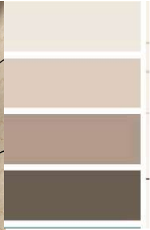
COLOUR PALETTE FOR TOILETS