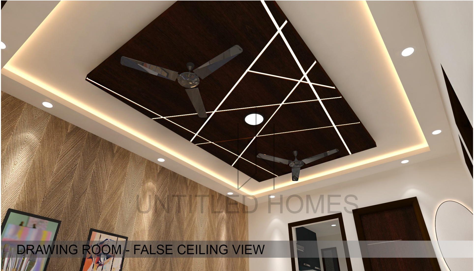
DRAWING ROOM - FALSE CEILING VIEW