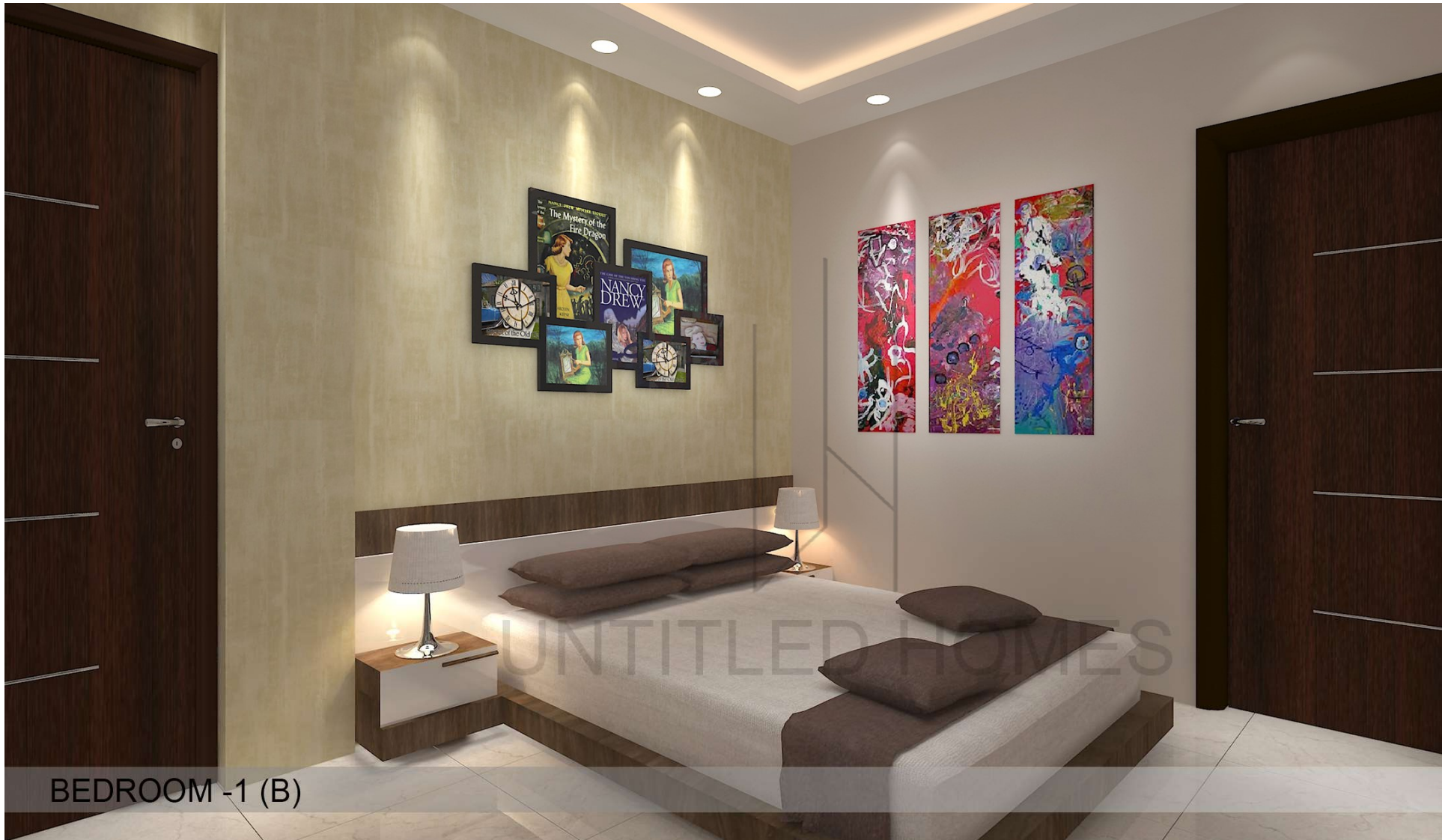
BEDROOM -1 (B)