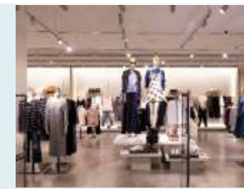
Double Height ceiling shops