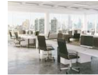
IT/ITES Office Space