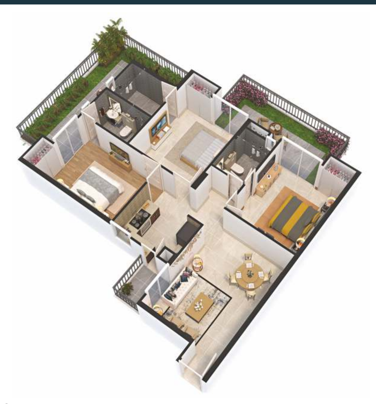
Unit - 4