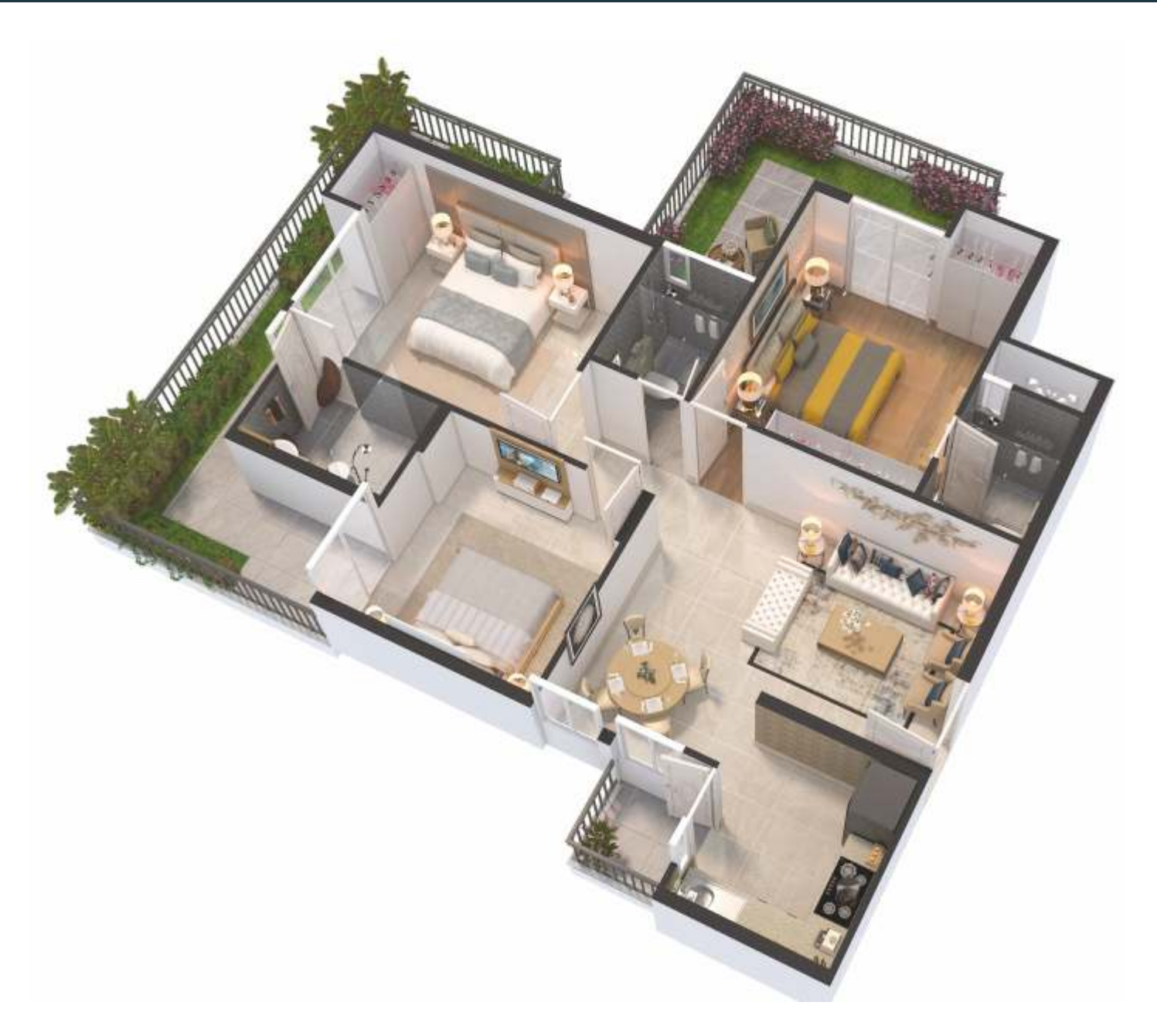
Unit - 1 & 7