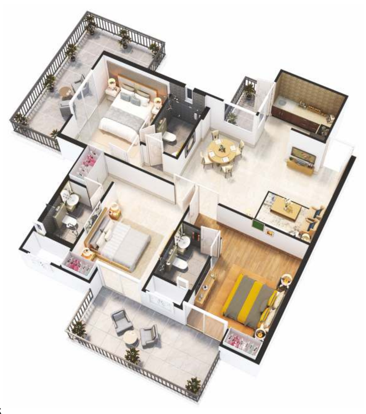
Unit - 5