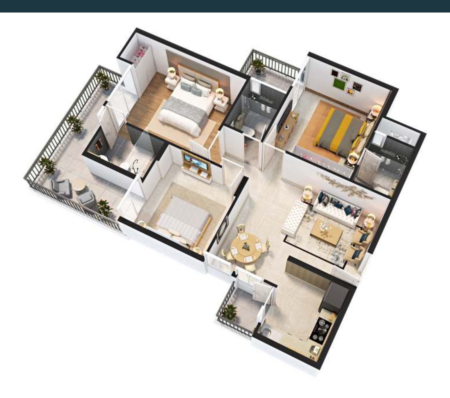
Unit - 1 & 7