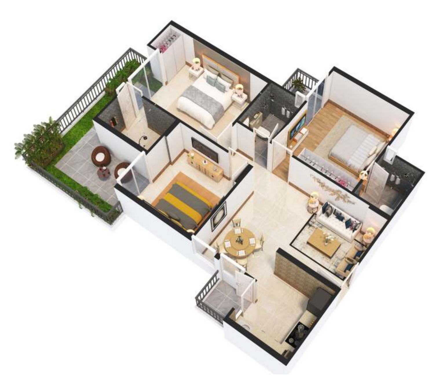
Unit - 2,3 & 6