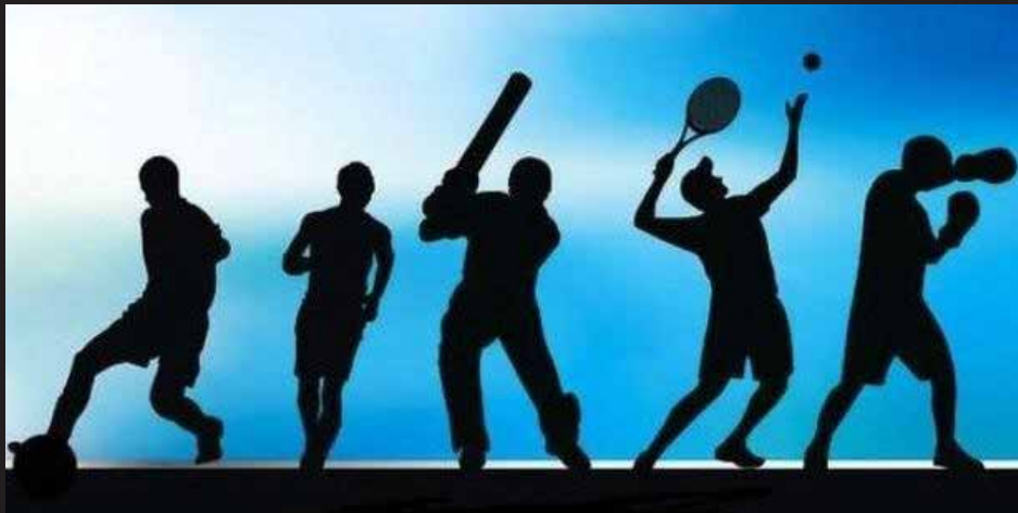
SPORTS ACADEMY BY TENVIC