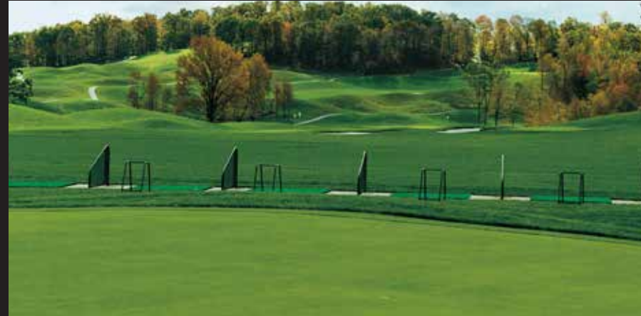
HIMALAYAN RANGE PRACTICE ACADEMY