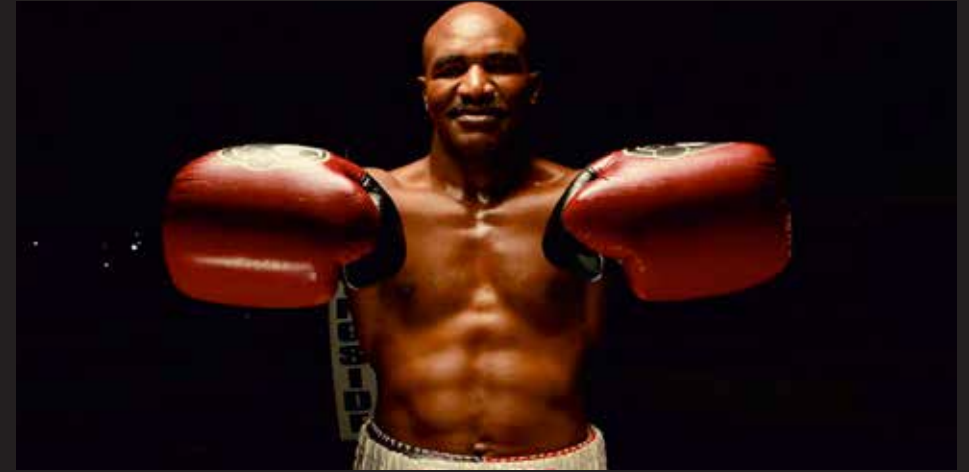
GYMNASIUM BY HOLYFIELD GYMS