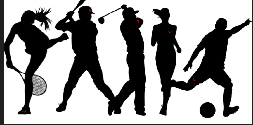
STATE-OF-THE ART SPORTS ARENA