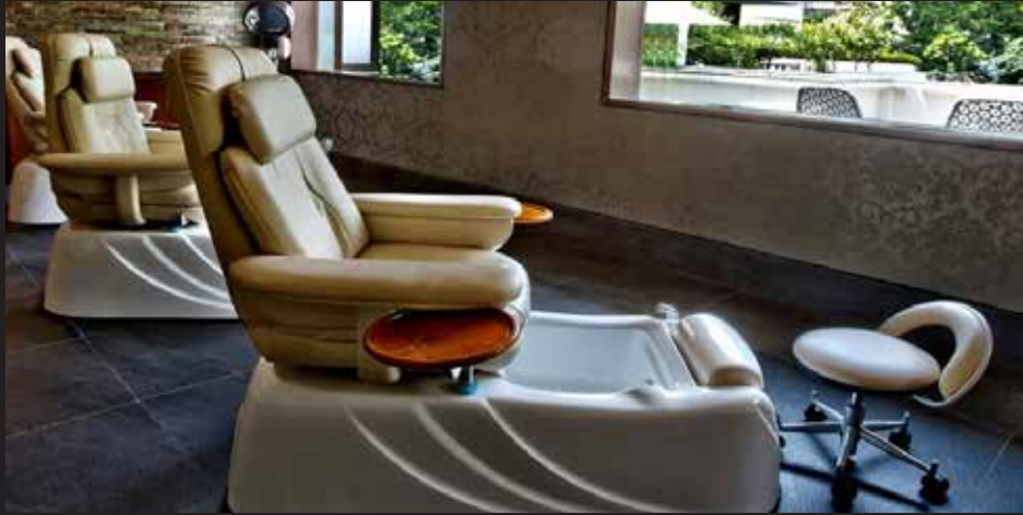
SPA & SALON BY WARREN TRICOMI