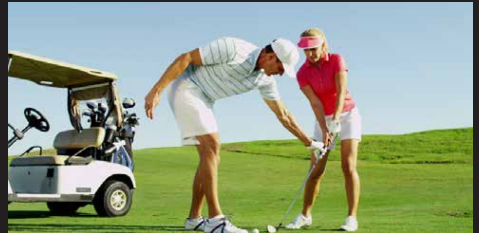
GOLF ACADEMY BY GOLFING NATION